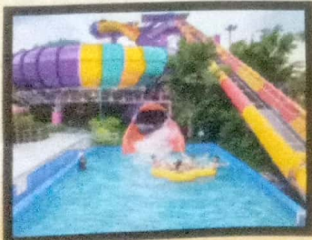
Water Park 10 (Min)