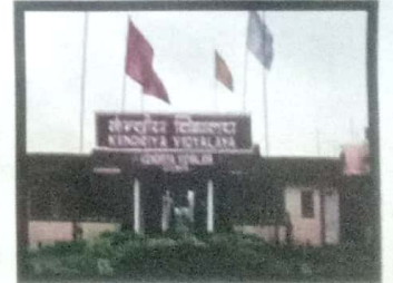
Kendriya Vidyalaya (10 Min)