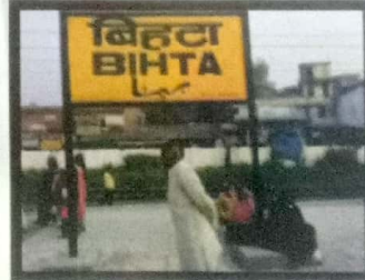
Bihta Rly- Station (10 Min)