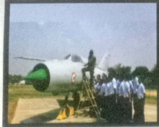
Bihta Air Base (05 Min)