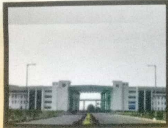
IIT Bihta (15 Min)