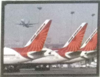
Inte. Airport (05 Min)